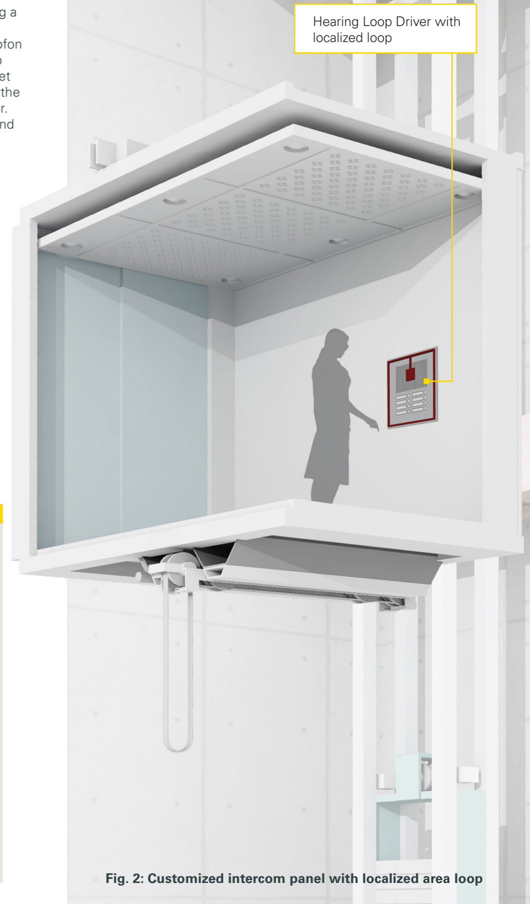
Fig. 2: Customized intercom panel with localized area loop

In the illustration to the right you will see an example using a customized panel. Users simply install a Vingtor-Stentofon Kit (TKIS-2) and Hearing Loop Driver behind the panel and let the panel itself blend in with the internal design of the elevator. The loop can be located around the edge of the panel or in another convenient place.