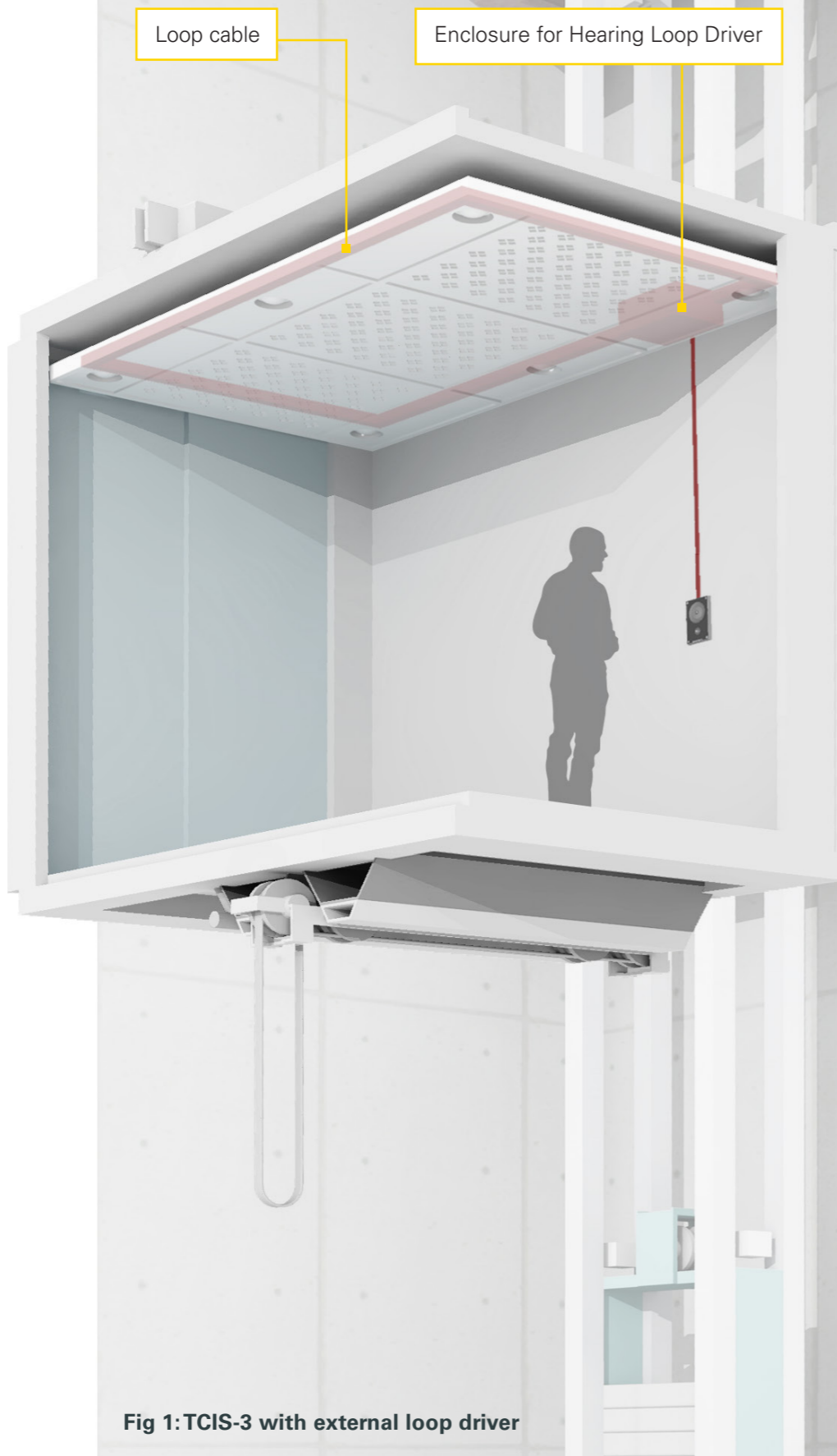
Fig 1: TCIS-3 with external loop driver

The illustration to the right showcases the solution with a multi-turn loop installed around the perimeter of a false ceiling that connects to any Vingtor-Stentofon intercom.